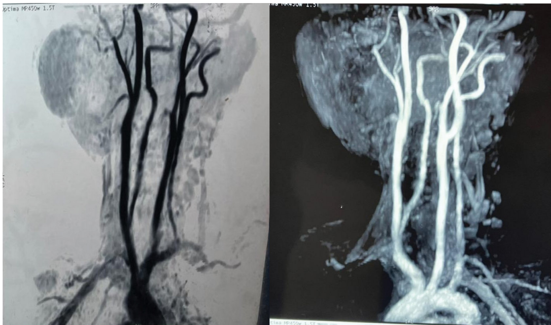
Fig. 2. (Left and Right) Angiography of Neck and Face arteries shows a left sided facial SOL, supplied by a branch of the left facial artery.