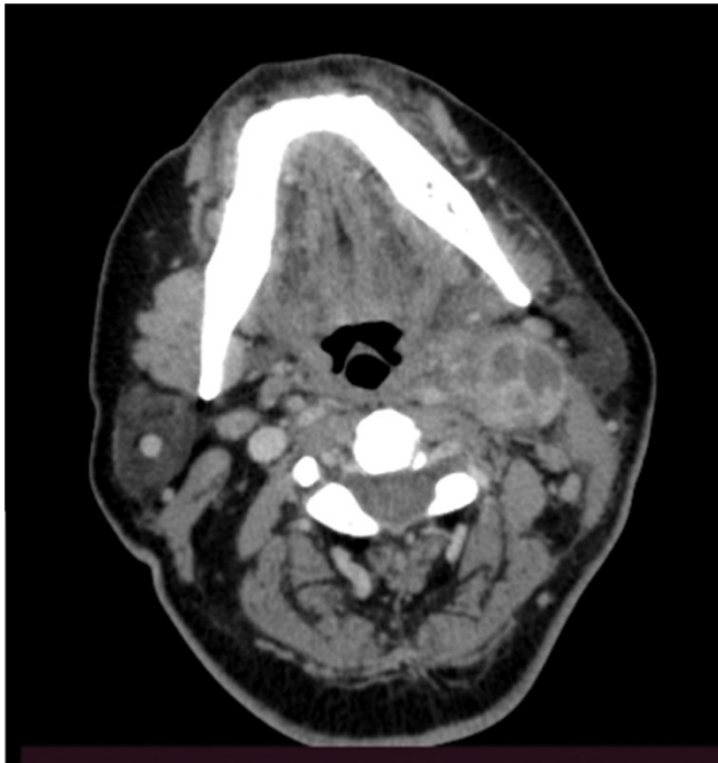
Fig.1. Non-enhancing lymph node conglomerate with areas of necrosis within abutting IJV

Aggressive antibiotics treatment for a week and