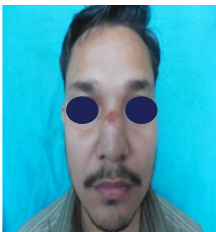
Fig.1. Dermoid cyst of nose with superadded skin inflammation

Operative Procedure: We selected a uniform protocol