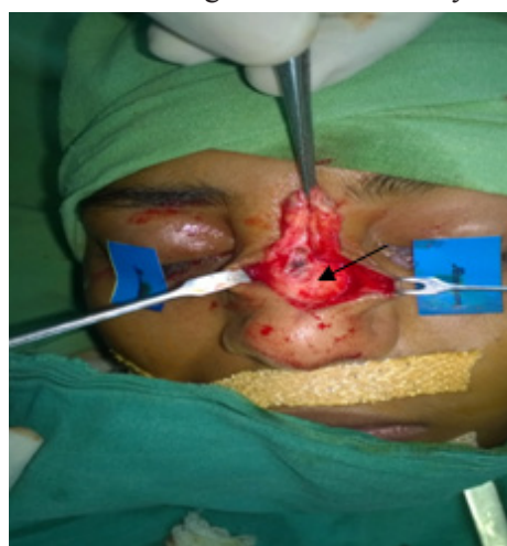
Fig.6. Excision of cyst becomes easy after delineation of sinus tract by injection of methylene blue dye

After total excision of the cyst or tract, soft tissue gaping were sutured by 4-0 synthetic absorbable (vicryl®) suture and the skin was sutured by 4-0 monofilament (ethilon®) suture without tension. Z-plasty closure was fashioned in one case to have best cosmetic result. Putting a drain is usually not needed