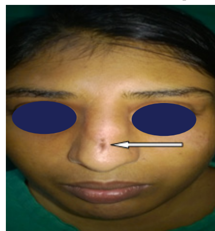
Fig.3. Midline nasal dermoid cyst with sinus (arrow) in a young female