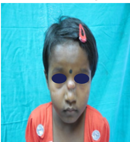
Fig.2. Globular dermoid cyst over dorsum of nose in a child