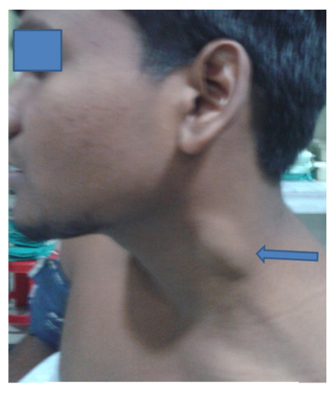
Fig.1 Clinical photograph at presentation. Arrow showing the venous swelling.

Biopsy revealed muscle fibres and fibroadipose tissue along with variable size of vascular channels lined by flattened epithelium consistent with venous malformation (Fig. 3).