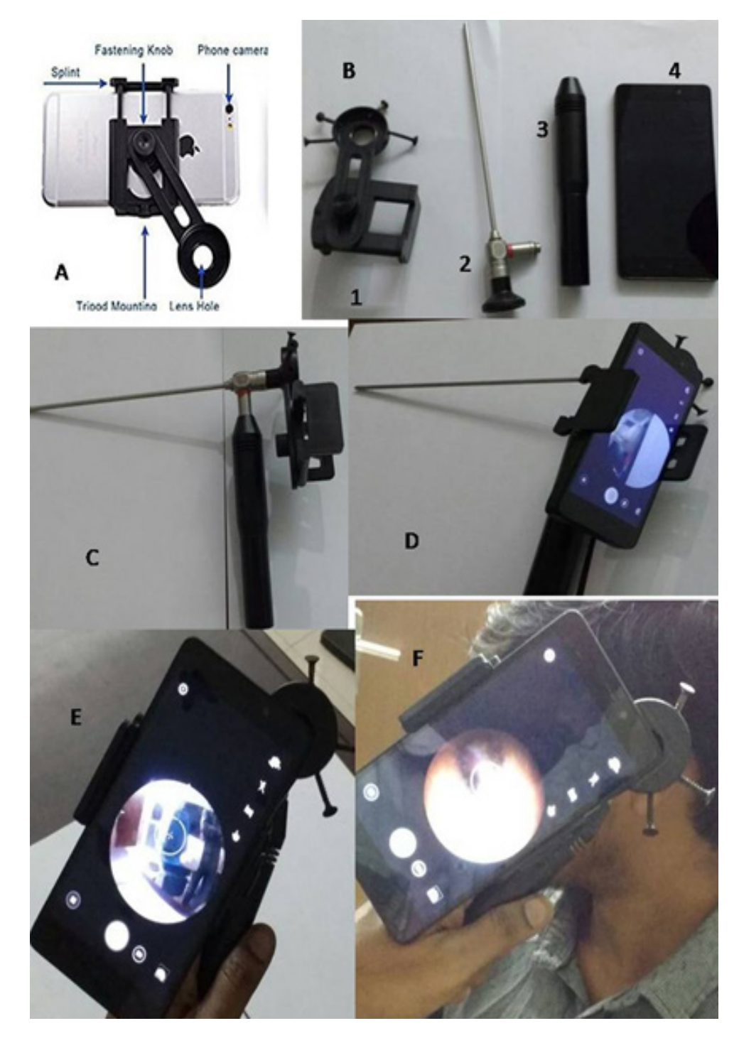
Fig. 1. ENT smart phone endoscopy unit: (A)Smart phone telescopic adaptor and its parts. (B) 1. Adaptor 2. Endocope 3. Portable light source 4. Smart phone. (C) Assembly of scope and adaptor. (D) Scope adaptor and phone as one unit. (E - F) usage of the portable Smartphone endoscope.

Bengal Journal of Otolaryngology and Head Neck Surgery Vol. 25 No. 3 December, 2017