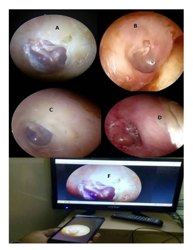
Fig. 2. Smart phone Oto-endoscopy pictures (A-D) (F) Mira cast/ chrome cast display on monitor

In conjunction with rigid scope the adaptor provides a fast and cost-effective solution with a smart phone in helping capturing saving photos and videos if required send these to a third party for quicker identification and documentation.