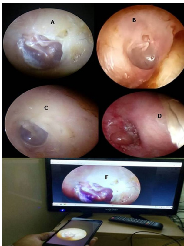
Fig. 2. Smart phone Oto-endoscopy pictures (A-D) (F) Mira cast/ chrome cast display on monitor

In conjunction with rigid scope the adaptor provides a fast and cost-effective solution with a smart phone in helping capturing saving photos and videos if required send these to a third party for quicker identification and documentation.