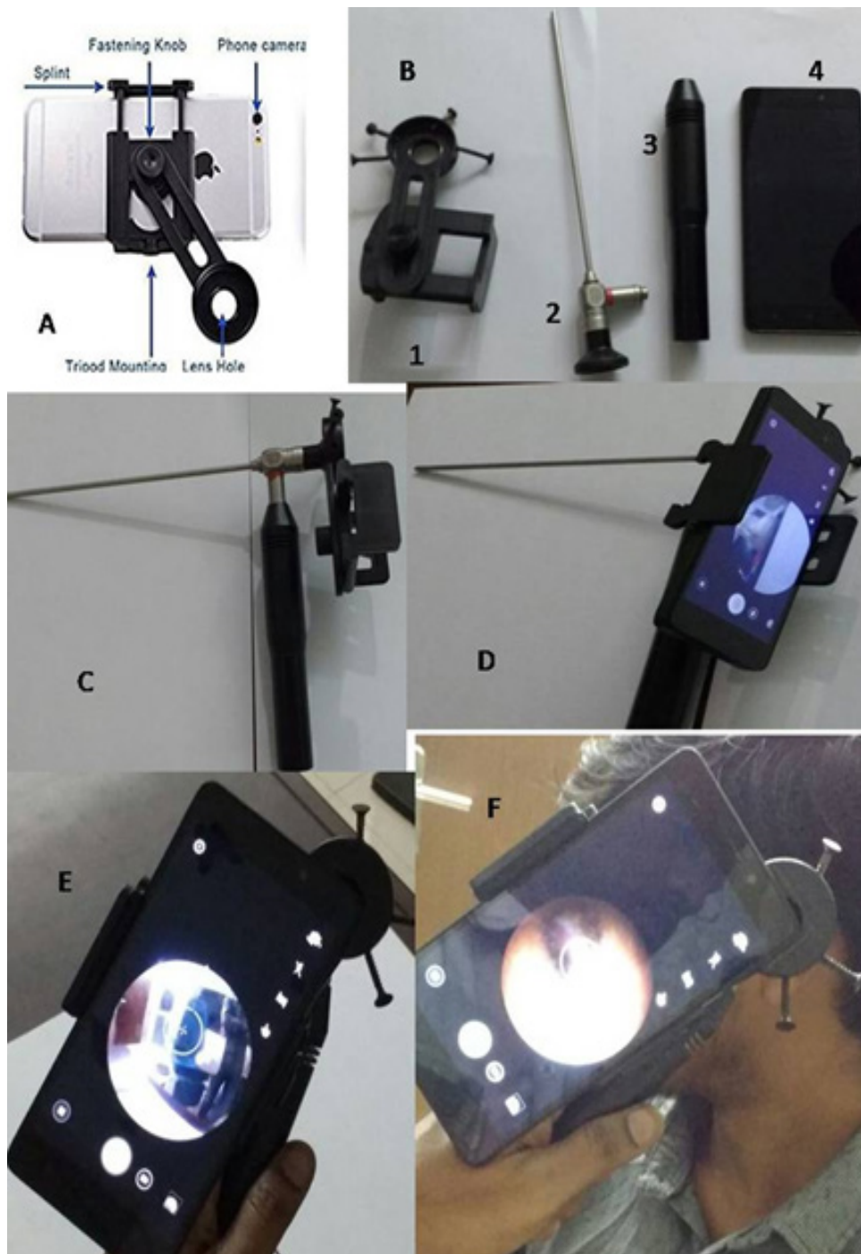
Fig. 1. ENT smart phone endoscopy unit: (A)Smart phone telescopic adaptor and its parts. (B) 1. Adaptor 2. Endoscope 3. Portable light source 4. Smart phone. (C) Assembly of scope and adaptor. (D) Scope adaptor and phone as one unit. (E - F) usage of the portable Smartphone endoscope.