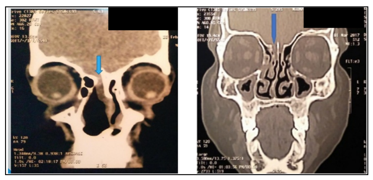
Fig. 1. Representative HRCT PNS images showing medial lamellar leak in two different patients.