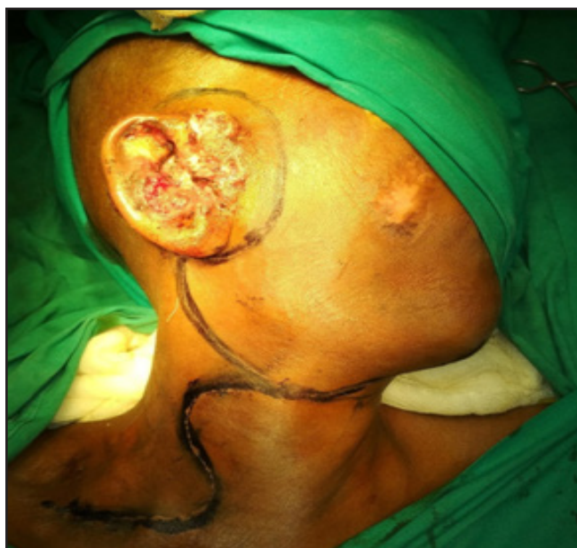
Fig.1. A case of Squamous cell ca involving right ear lobule with extension to pre-aural region and adjacent parotid gland

After primary resection and neck dissection (Fig. 2), patient is put to prone position with arm adducted and palm looking anteriorly to make scapular medial border