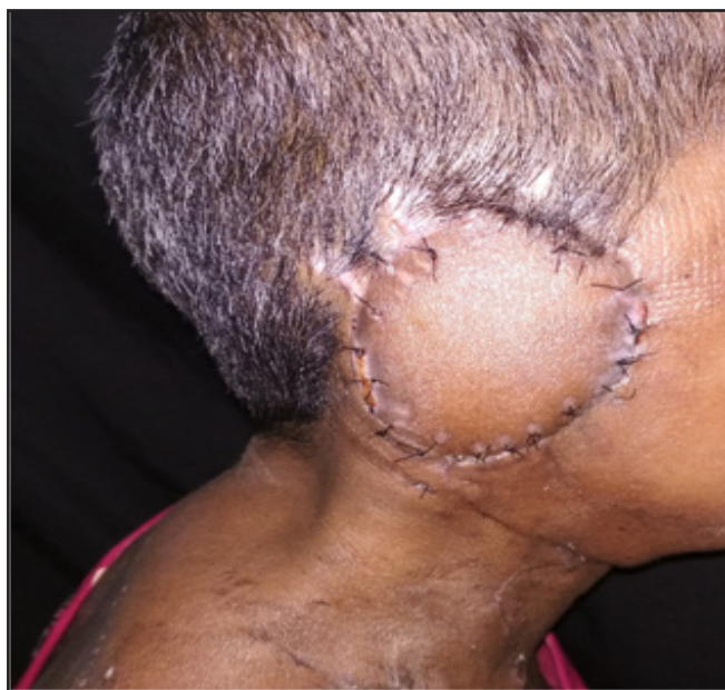
Fig. 7. 10 days after operation

compromise of skin paddle, which is supplied by perforators through muscle) and is drawn between spine and medial border of scapula and can be extended up to 5 cm below inferior angle of scapula.