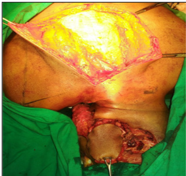
Fig. 5. Delivery of flap to recipient area

The skin paddle is marked according to the size of defect (not less than 4 finger breadth, to avoid vascular