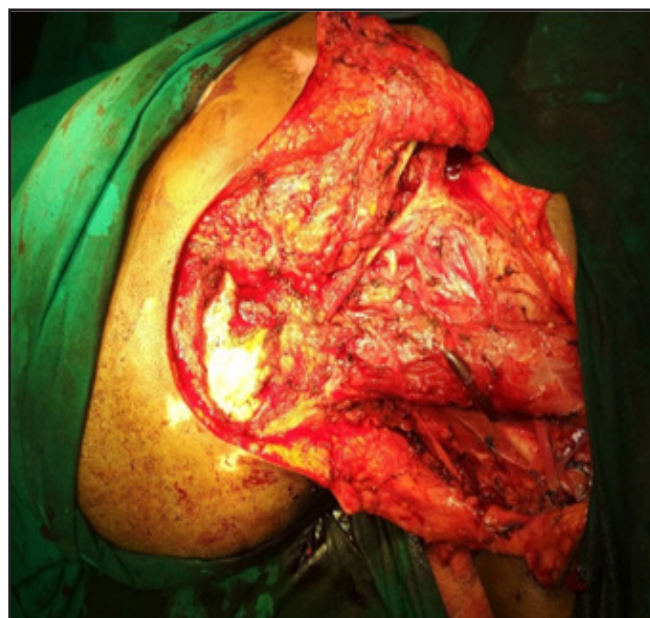
Fig. 2. After wide local excision of mass with mastoidectomy