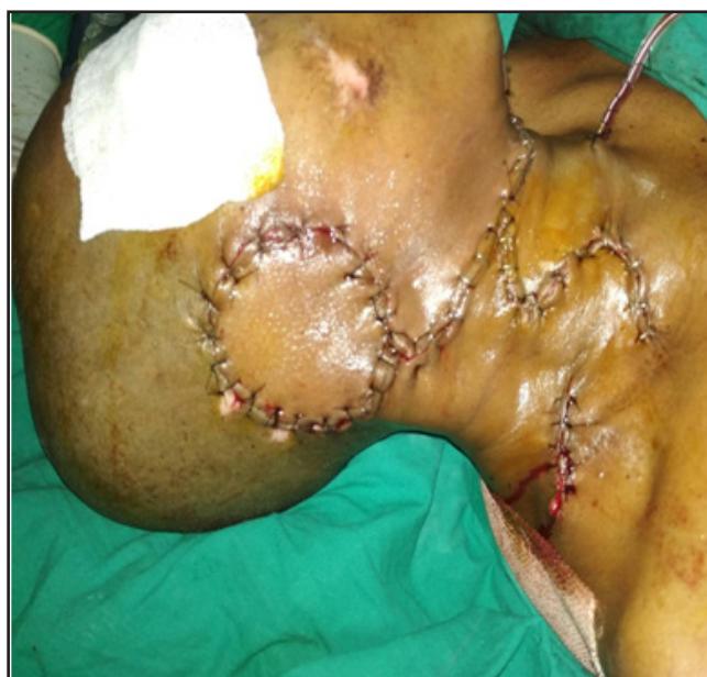
Fig. 6. After final reconstruction