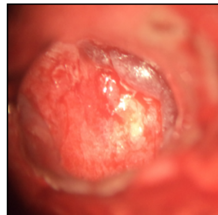
Fig. 3. After graft placement

Hospital, West Bengal, India, over the period of 2½ years from March 2014 to August 2016. Primary type 1 tympanoplasty cases irrespective of age, size and site of perforation, laterality and eustachian tube function were included in the study. In all cases the ear was dry and with normal middle ear mucosa for at least one month prior to surgery. History of previous tympanoplasty or mastoid surgery, discharging ear, cases requiring ossicular reconstruction or mastoidectomy were excluded from the present study. Those without sufficient follow-up for one year after surgery, without preoperative or postoperative hearing tests were also excluded.