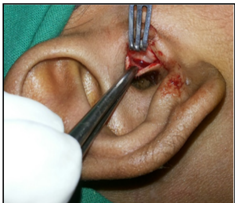
Fig. 1. Harvesting tragal cartilage with perichondrium