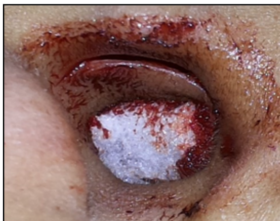
Fig. 4. Incision line secured with gelatin sponge

after operation, one out of two cases in each group of medium and large perforation healed spontaneously. So the final successful graft take was 97.89%. Two cases of residual perforation were treated at the end of 12 months after operation, one with chemical cautery, another with fat grafting. Average Air Bone Gap (ABG) 6 months after operation was 14.78 dB, 18.54 dB and 22.69 dB in small, medium and large perforation group respectively (Table III). Average ABG 12 months after operation was 12.29 dB, 13.56 dB and 14.09 dB in small, medium and large perforation group respectively. Wound healing of the graft taking site was perfectly well in all patients.