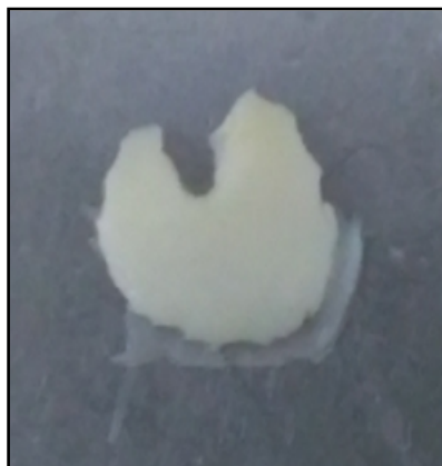
Fig. 2. Final shape of cartilage-perichondrium graft