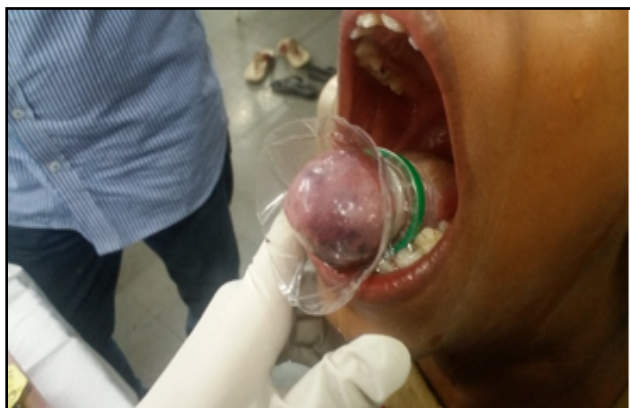
Fig.1. The entrapped tongue

Past history revealed that child had tongue haemangioma on left side of dorsum of the tongue since birth. Keeping this in mind, after holding the child, we made attempt to cut open the neck of the bottle with strong Mayo's scissors. But, Mayo's scissors could not cut through the neck of the bottle. As the oedema was increasing, we planned to take the child under intravenous sedation in the operation theatre. We planned to use a Gigli saw for sectioning the neck of the plastic bottle.