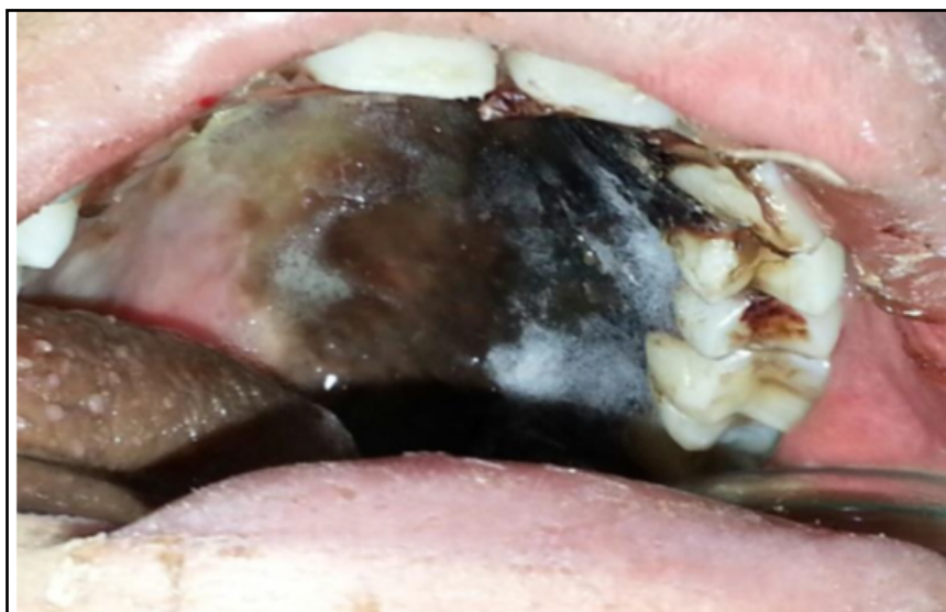
Fig. 1. Mucormycosis in a 15 year old boy with palatal involvement with eschar of palate.