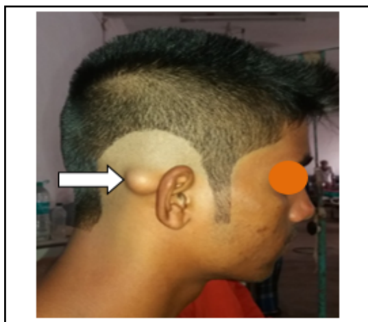
Fig.1: Figure showing right retro-auricular mass

after subtle accidental trauma to the region. There was no history suggestive of any infectious pathology. The family history was unremarkable. Physical examination showed a tumour of approximately 3x3cm in the right post auricular region, of bony consistency, smooth surface, rounded, not mobile. Otoscopy was normal. Tests for the facial and other cranial nerves showed no abnormality. Rest of the ENT examination was within normal limits. No other significant abnormality