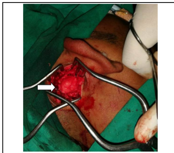
Fig.3: Figure showing intra-operative view of the lesion

Asymptomatic patients can be followed up with observation. Symptoms such as conductive hearing loss, recurrent ear infection or intolerable disfigurement warrants surgical resection. Mastoid and squamous