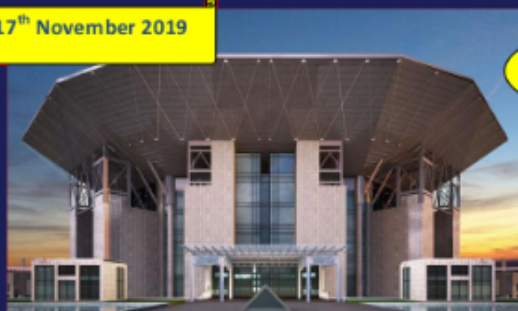
Biswa Bangla Convention Centre, Kolkata

Early Bird Registration Up to 31 st March 2019