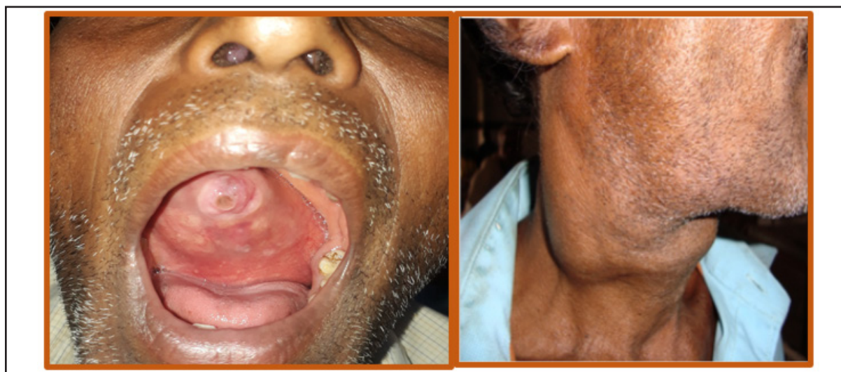
Fig. 3. Presentation as an intraoral mass and as a neck mass

In the transcervical group, one patient suffered from