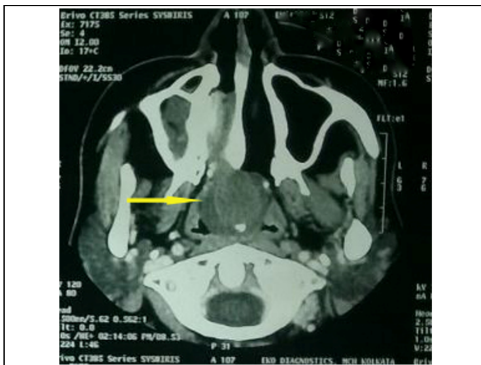
Fig. 3. Non contrast enhancing mass in left nasal cavity extending to nasopharynx

dynamic status was ensured. The stay in hospital was uneventful with the patient getting discharged in afebrile state with subsided neck swelling, after 3 weeks of injectable antibiotic administration. No surgical intervention had to be resorted to for the neck mass. Intranasal corticosteroid spray and oral antibiotics consisting of amoxicillin clavulanate was prescribed for three weeks along with probiotic capsules. Subsequent diagnostic nasal endoscopies showed that the nasal passage had cleared considerably due to reduction in size of the nasal polyp. Endoscopic excision of the nasal polyp was planned two months later after optimization of the glycemic status of the patient but she did not give consent for surgery and opted for medical management of rhinosinusitis.