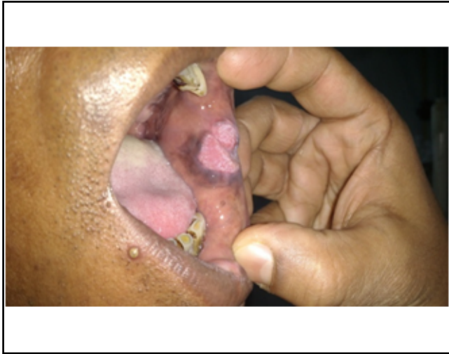
Fig. 1. Appearance of the buccal lesion before treatment