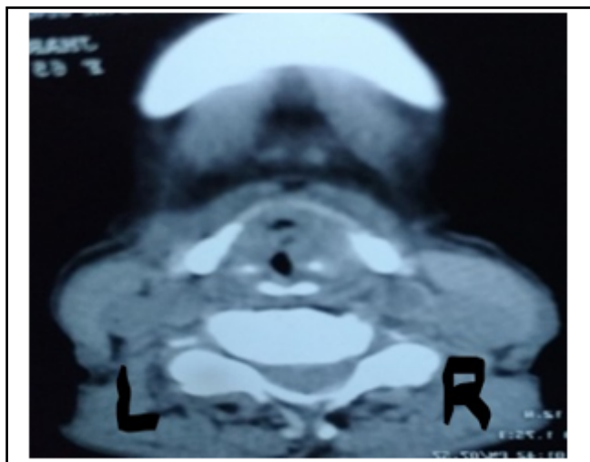
Fig. 3. CECT scan of neck and larynx at the level of thyroid ala showing cartilage breach on right side

came out to be well differentiated keratinizing squamous cell carcinoma. The patient was then planned for total laryngectomy as in this T3 glottic disease with dysfunctional larynx in the same sitting with excision of buccal carcinoma followed by repair and neck dissection and adjuvant radiotherapy and the patient party counselled likewise with informed consent taken. Total laryngectomy was done by conventional technique using Gluck-Sorenson incision and the usual postoperative period was uneventful. The patient was discharged after two weeks. The patient was followed up in the OPD after three weeks of surgery with HPE report of the specimens of total laryngectomy, excised buccal mucosa and supraomohyoid neck dissection. The HPE report of excised buccal mucosa specimen was moderately differentiated non keratinizing squamous cell carcinoma with depth of invasion less than 5mm and margins were free from tumour, laryngectomy specimen was well differentiated keratinizing squamous cell carcinoma, neck dissection specimen was deep fascia and no lymph node sample detected. The patient during the postoperative period had normal oral stoma with adequate mouth opening and the neck wound was healthy with patent airway (adequate permanent tracheostoma). The patient was then referred for external beam radiation therapy and he was thereafter followed up every 1 month for 3 months and thereafter