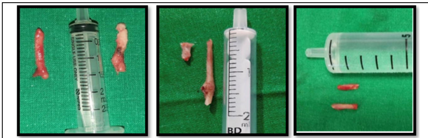
Fig.3. Post operative specimen of styloid process after tonsillo-styloidectomy

with oral antibiotics and analgesics, followed up on day 7, day 14 and 1-month following surgery and she showed prompt relief of symptoms.