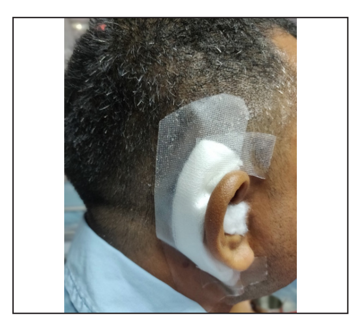
Fig. 1. A patient with single gauze piece dressing secured using adhesive tape.

can only be accepted in India after due deliberation.