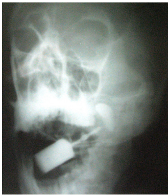
Fig. 1 Sialogram showing fusiform dilatation of the Stensen's duct

The Stensen's duct was cannulated with a 24 G intravenous cannula and a sialography performed. No resistance was encountered while inserting the cannula. The sialogram (Fig. 1) revealed a dilatation of the Stensen's duct some distance proximal to its opening into the oral cavity.