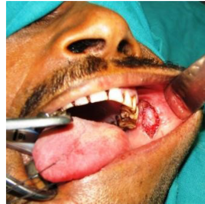
Fig. 2 Semilunar incision made anterior to Stensen's duct opening

After local anaesthesia with infiltration of 2% lignocaine and 1/100,000 adrenaline solution, the parotid (Stensen's) duct was cannulated with a 24 G intravenous cannula and trypan blue solution was injected into the duct. A vertical semilunar incision, with an anterior convexity was made on the buccal mucosa about 1 cm in front of the parotid duct opening (Fig.2). The Stensen's duct opening was retracted medially with a 3-0 silk stay suture and using a small hemostat the dilated duct was dissected out. A vertical incision was made on the lateral wall of the dilated duct and the ductal ectasia opened up. The posterior lip of the incised duct was sutured to the anterior lip of the buccal mucosal incision. The Stensen's duct opening along with a large portion of the medial wall of the ectatic segment and the overlying mucosa was excised and the margins of the ectatic duct mucosa sutured with the surrounding buccal mucosa. The ectatic duct was thus marsupialised (Fig.3). The surgical site was dressed with a bolster sutured over it. The bolster was removed after 24 hours. Post operative recovery was uneventful. The sutured