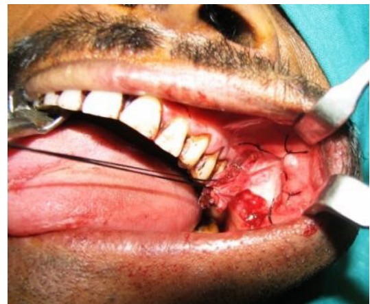
Fig. 3 Marsupialisation of ectatic segment

The patient had no recurrence of the condition till 2 years of follow up.