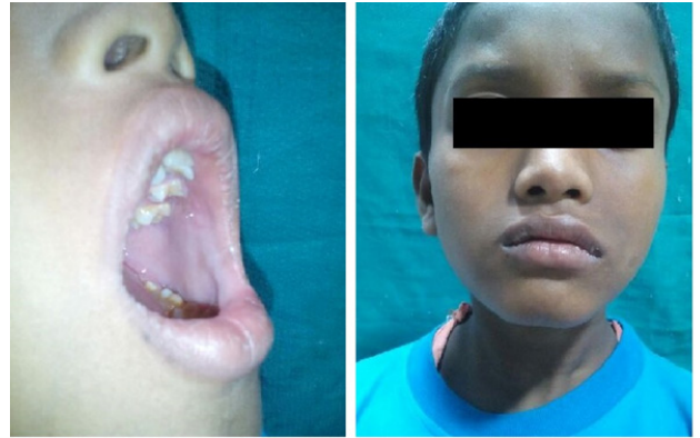
Fig. 5. Clinical Photograph of the patient after 15 days

intra oral sites affected by neurilemmomas, tongue is the most common. 3,9 Cheek is much rare site of this type of tumour. Gallo et al. analyzed 157 cases found in literature, where 45.2% of the cases involved the