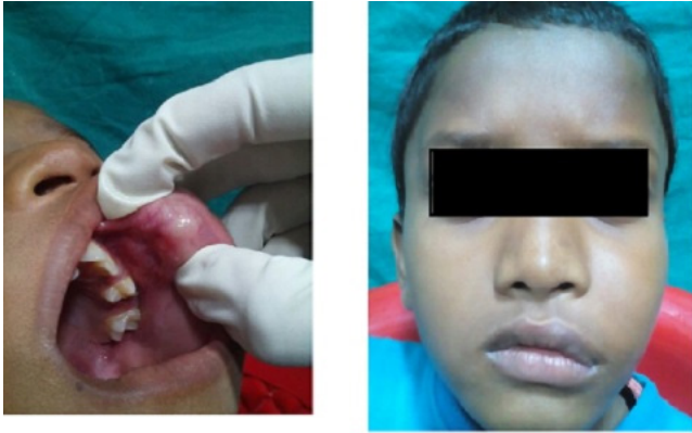
Fig. 1 Clinical photograph of the patient

Magnetic resonance imaging was then advised to assess the extent and other soft tissue involvement