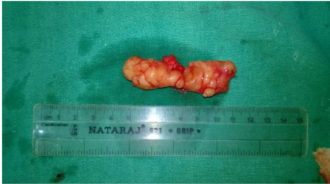
Fig. 3 Macroscopic view of the tumor

Verocay in 1910 first described a group of neurogenic tumours, termed as 'neurinomas'. 4 In 1935, Stout proposed that these tumours arose from nerve sheath