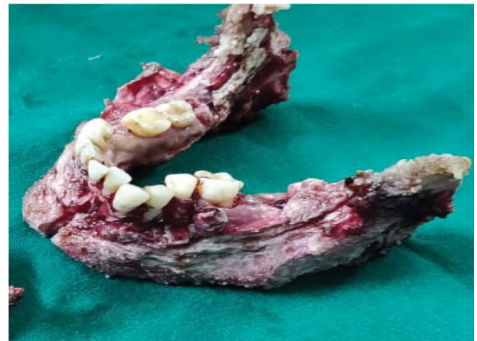
Fig. 3. Specimen of mandibulectomy