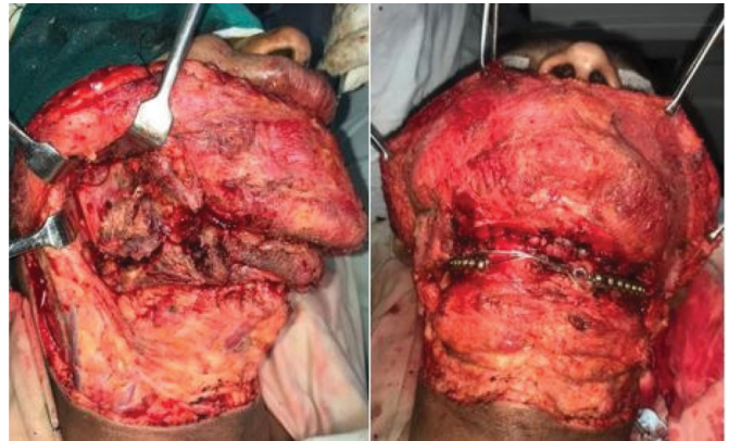
Fig. 2. Mandibulectomy and reconstruction with plates

discharging sinus and swelling of skin over mandible region and underwent hemimandibulectomy. Case 5 came back with frontal osteomyelitis after 5 months of primary surgery. He underwent bicoronal flap elevation and surgical debridement of frontal osteomyelitis. Patient expired 2 weeks after the surgery due to cardiac arrest.